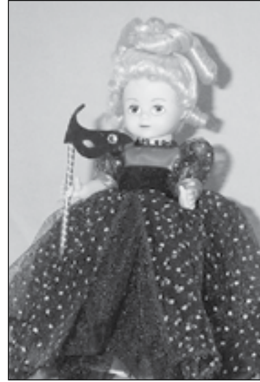
Halloween dolls on display.

Throns celebrate Halloween in the village, and so CANDY donations are appreciated!!! Individually wrapped candy can be donated at the Amherst Fire Dept. Central Station Complex, located at 177 Amherst Street, and at the Congrega-