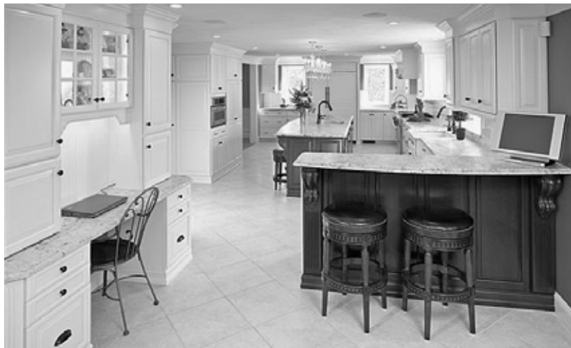
Remodeled Bedford kitchen created by Granite State Cabinetry.

Homes in seven Manchester and Bedford will be open from 10:00 am to 4:00 pm. An open seating luncheon catered by O Steaks and Seafood, will be available between 11:30 am and 3:00 pm at Baron's Major Brands in Manchester and a special event will be held weather permitting outside on the garden terrace at the Copper Door Restaurant in Bedford following the tour.