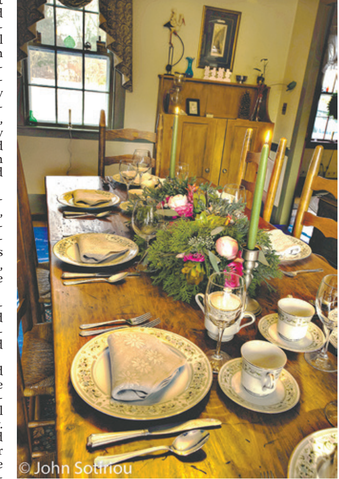
A Tour of Five Houses Decorated for the Holidays, returns this year on Saturday, December 13. Five historic homes will be decorated for the season.

All proceeds support the continued preservation of the historic meetinghouse on the Town Green. Tickets are $30 in advance; $40 on the day of tour. Additional information and tickets available at www. ccamherst.org/cav or at 603 673-3231 and at the Woman's Association Holiday Fair at the church on November 22. Tickets are also available in Amherst at the Black Forest Cafe, Moulton's Market, Amherst Garden Center & Flower Shop and in Milford at the Toadstool Bookshop.