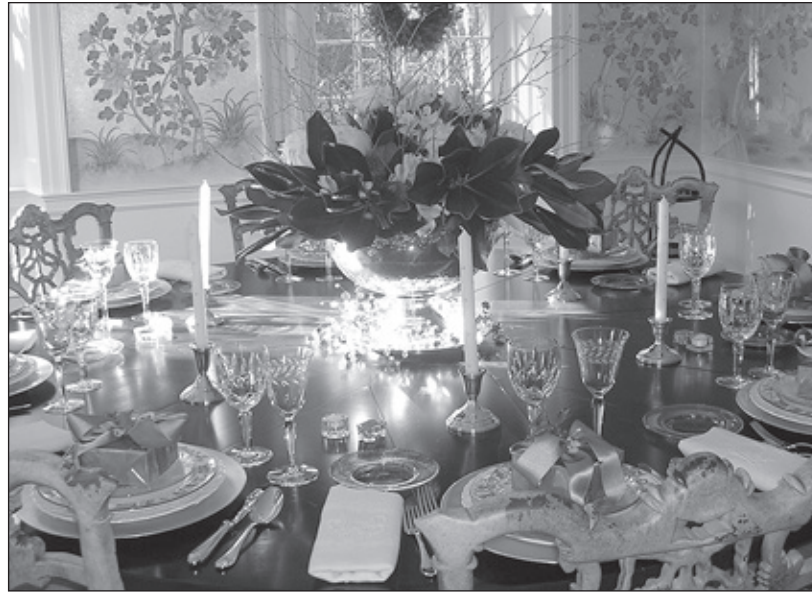
Beautiful Table setting from a prior house touse

AMHERST – The Christmas in Amherst Village House Tour is planned Saturday, December 13. This very successful and popular holiday tradition attracts men and women interested in Amherst history, historic homes and holiday decorating.