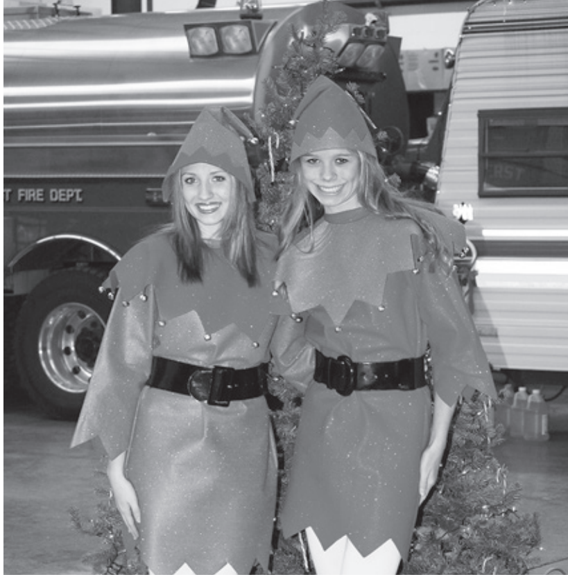
Two of our Amherst Girl Scout Elves who assist Santa at the Tree Lighting Ceremony on Friday and at the Fire Station on Saturday.