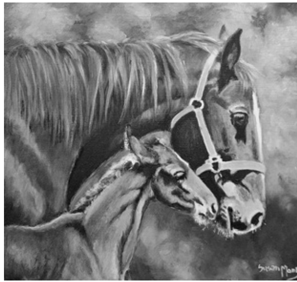
Susan Monty - Mare and Foal - oil

The concert takes place on November 29 at 7:30 p.m. at the Stockbridge Theatre Manchester. Tickets are available through the Stockbridge Theatre box office at 437-5210, or online at www.stockbridgetheatre.com. Standard ticket prices range from $12- $50, with discounts available for seniors. Students from Elementary-College are now $5. Complete information about the 110th season of the New Hampshire Philharmonic can be found at www.nhphil.org.