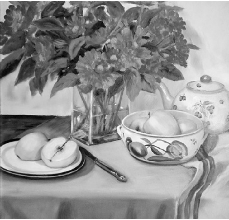
Jackie Cunningham, "Yellow Apples", 18