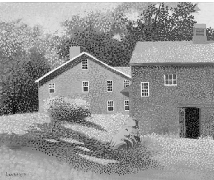
Priscilla Levesque, "Red Wing Farm" Image size 11" x 9" casein