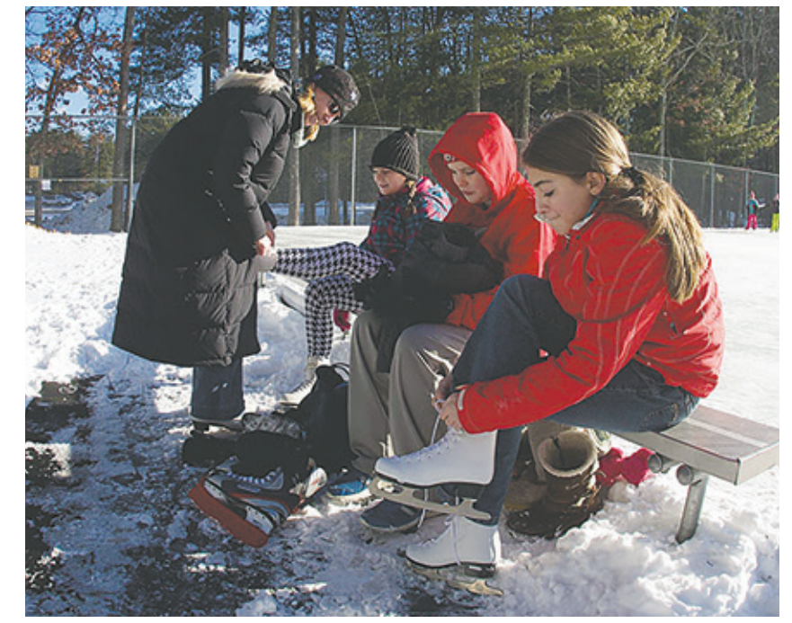
Skaters lace up at the new Ice Skating Rink at Amherst Middle School

AMHERST – We're here to help! That's the bottom line. The newly established Amherst Community Foundation is a 501c3 non-profit with the following mission, "The purpose of the Foundation is to enhance the quality of life in Amherst by raising and providing funds for programs that benefit our community. The Amherst Community Foundation (ACF) will provide ways for individuals, organizations and corporations to channel their philanthropic giving for educational, cultural,, environmental and/or health and wellness initiatives with the Town" We