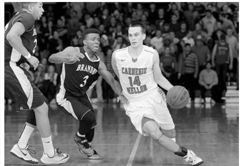
Former Souhegan student-athlete scores big at Carnegie Mellon