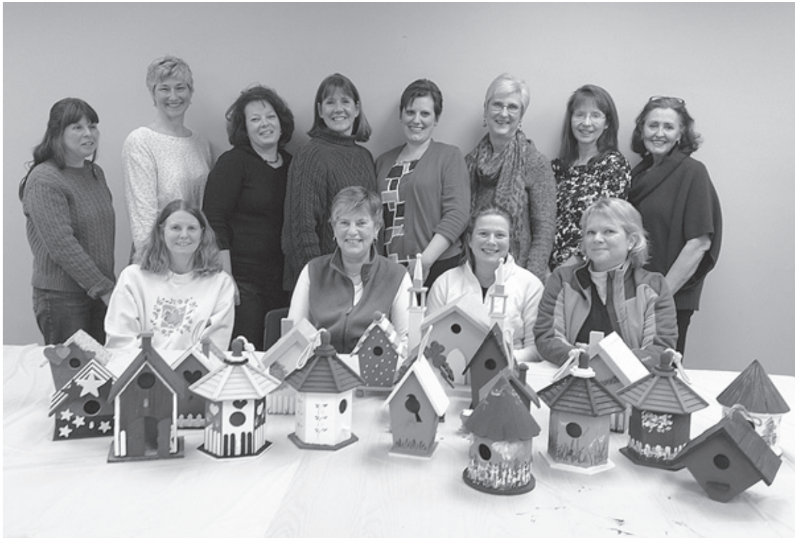
Amherst Area Newcomer's group enjoyed an evening of socializing and painting birdhouses at their March monthly event. Visit our website NHnewcomers.com to learn more about our group. We would love to have you join us!