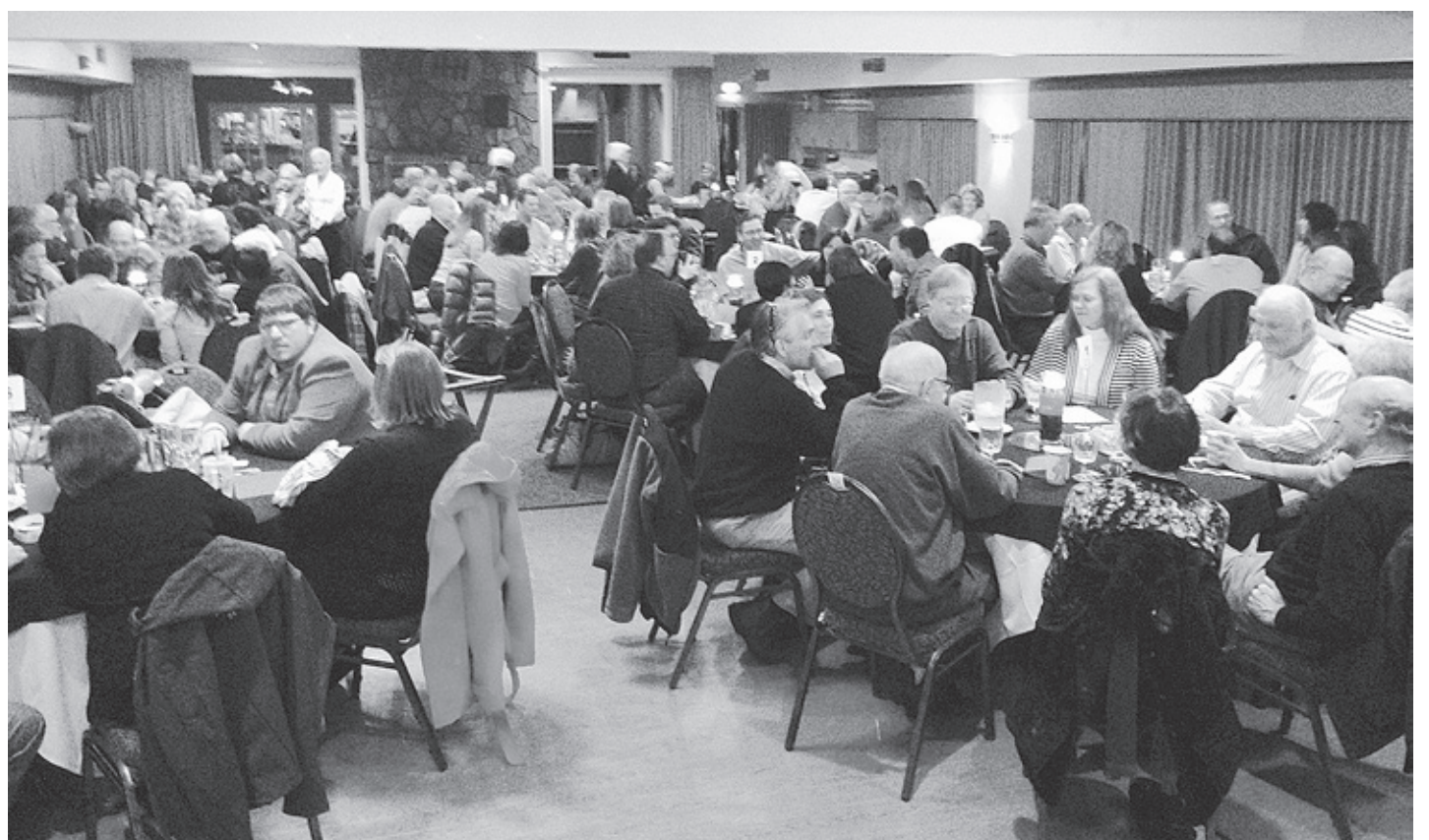
The 3rd Annual Friends of the Amherst Town Library Trivia Night fundraiser was a great night. Read letter on page 2.