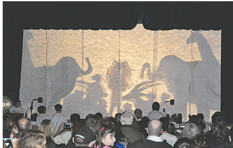
The audience was treated to a creative shadow show by students on stage