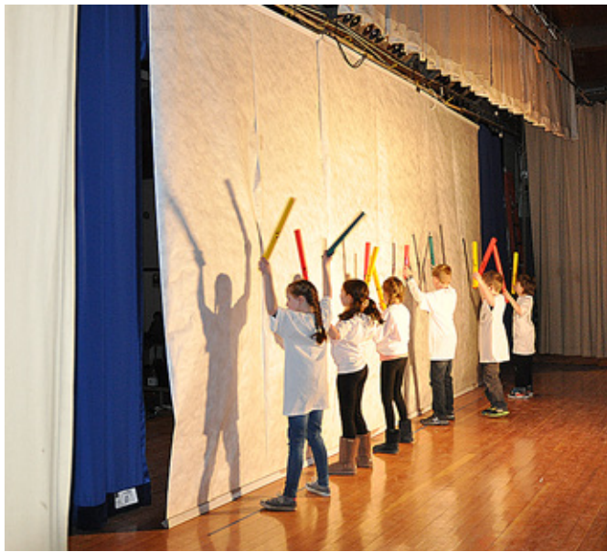
Students are shown playing the parts of shadow puppets