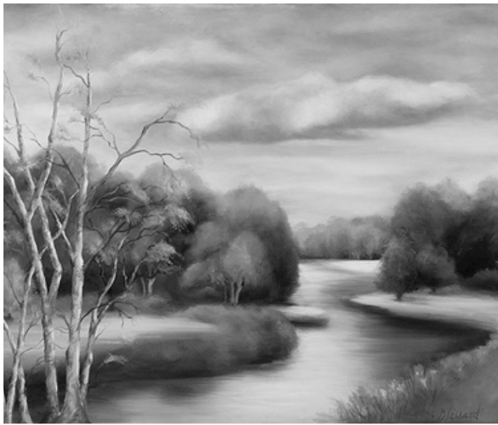
Dee Lessard; Birch Banks oil 18x28