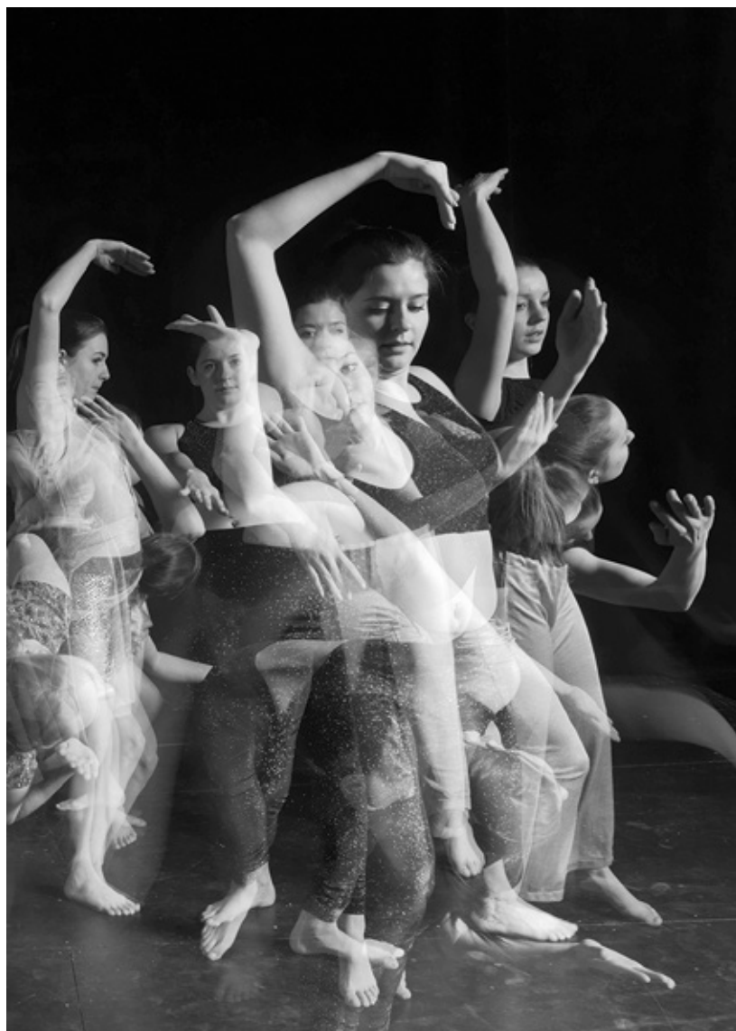
Keene State College senior dance majors will perform in the 40th anniversary of An Evening of Dance Wednesday to Saturday, April 15 to 18, at 7:30 p.m. in the Main Theatre of the Redfern Arts Center. KSC Department of Theatre and Dance alumni will return for an extravaganza of modern dance over four nights with a different alumni group dancing each evening. Tickets are $10 for adults, $8 for senior citizens and youths, and $6 for KSC students. Contact the Redfern Box Office at 358-2168 or order online at www.keene.edu/racbp .