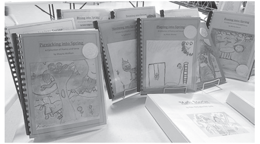
Display of Student Writings and Book Fair in the Wilkins School all purpose room.