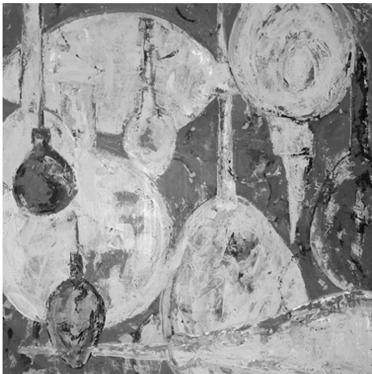
"Rhapsody in Red and Yellows"