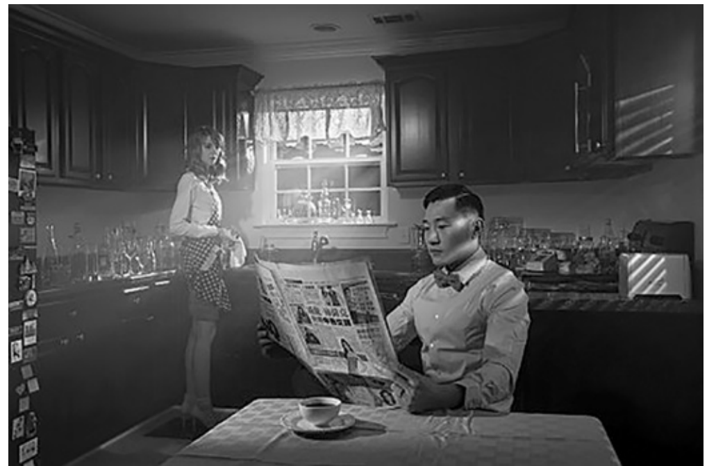
Bin Feng, The American Dream - Oh Darling! It's too distracting! Digital C-print.

"We're very happy to introduce these very gifted, emerging young artists to the New